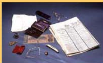
Lincoln realia, 1865 New York Times , vol. XIV, no. 4236 (April 15, 1865)

Rare Book & Special Collections Division